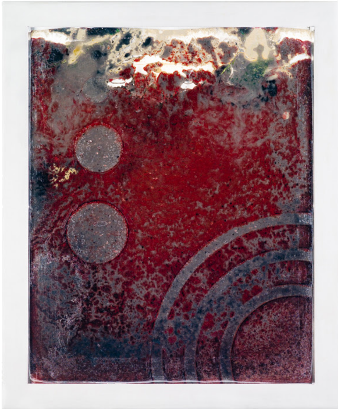
Eduardo Kac, Oblivion , 2006. Biotope 48,2 x 58,4 cm (19 x 23 in).