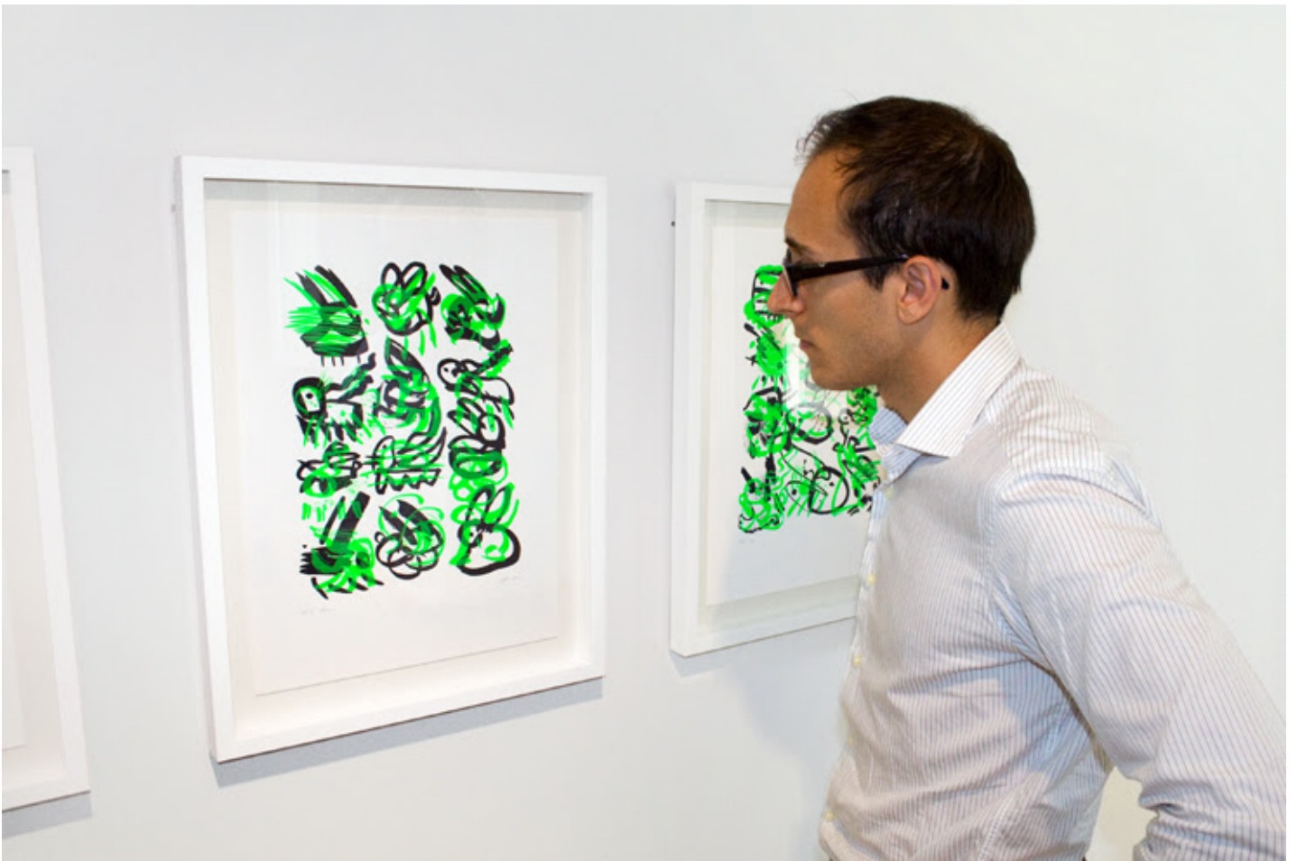
Eduardo Kac, Lagoglyphs: The Bunny Variations #2 , 2007. Silkscreen print, 40 x 54 cm (15.7 x 21.2 in).