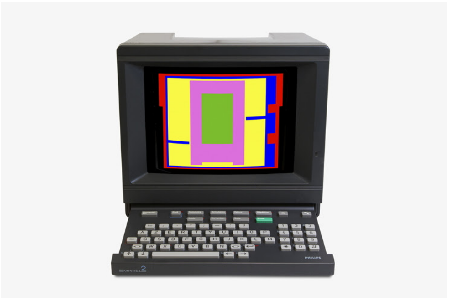
Eduardo Kac, Tesão [Horny], 1985-1986. Minitel artwork.