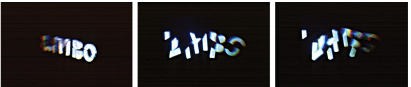
Eduardo Kac, Andromeda Souvenir , 1990. Hologram, 30 x 40 cm (11.8 x 15.7 in).