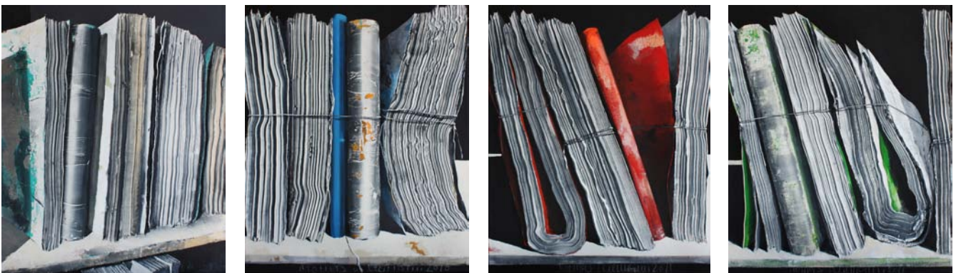
Archives I, II, III, IV, 2011, oil, acrylic, silicium carbide on canvas, 61 x 51 cm