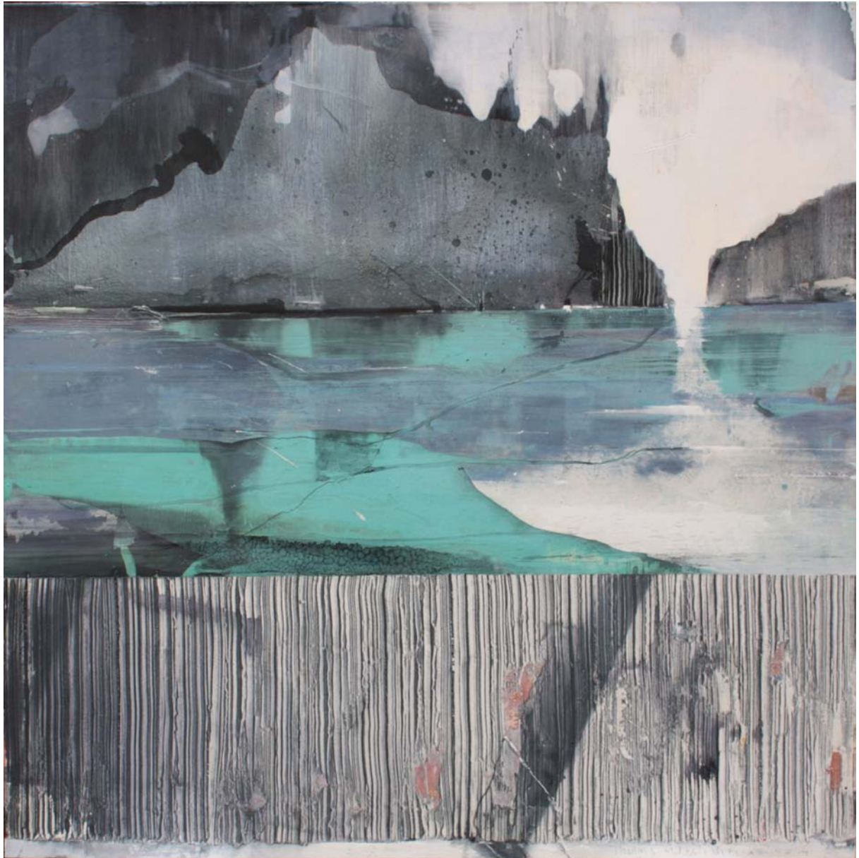
Cheers, Bocklin 2009, mixed media, 150 x 150 cm