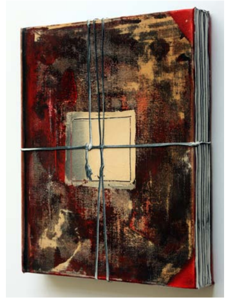
Painter's book 3, mixed media on canvas, 30X24 cm