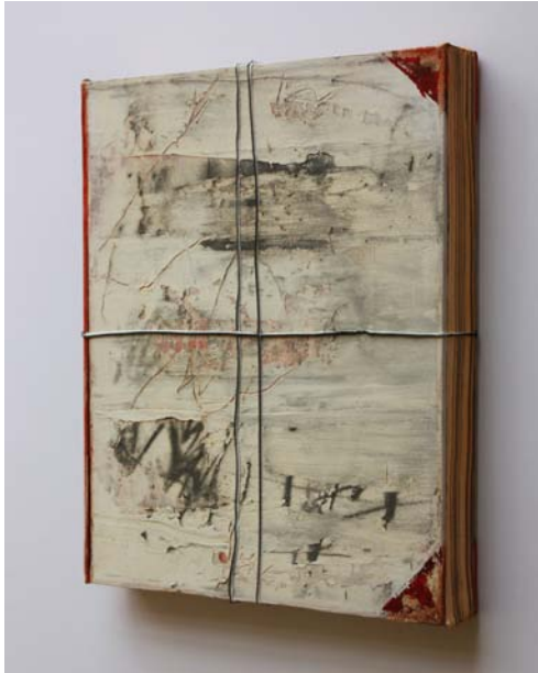
Painter's book 4, mixed media on canvas, 30X24 cm