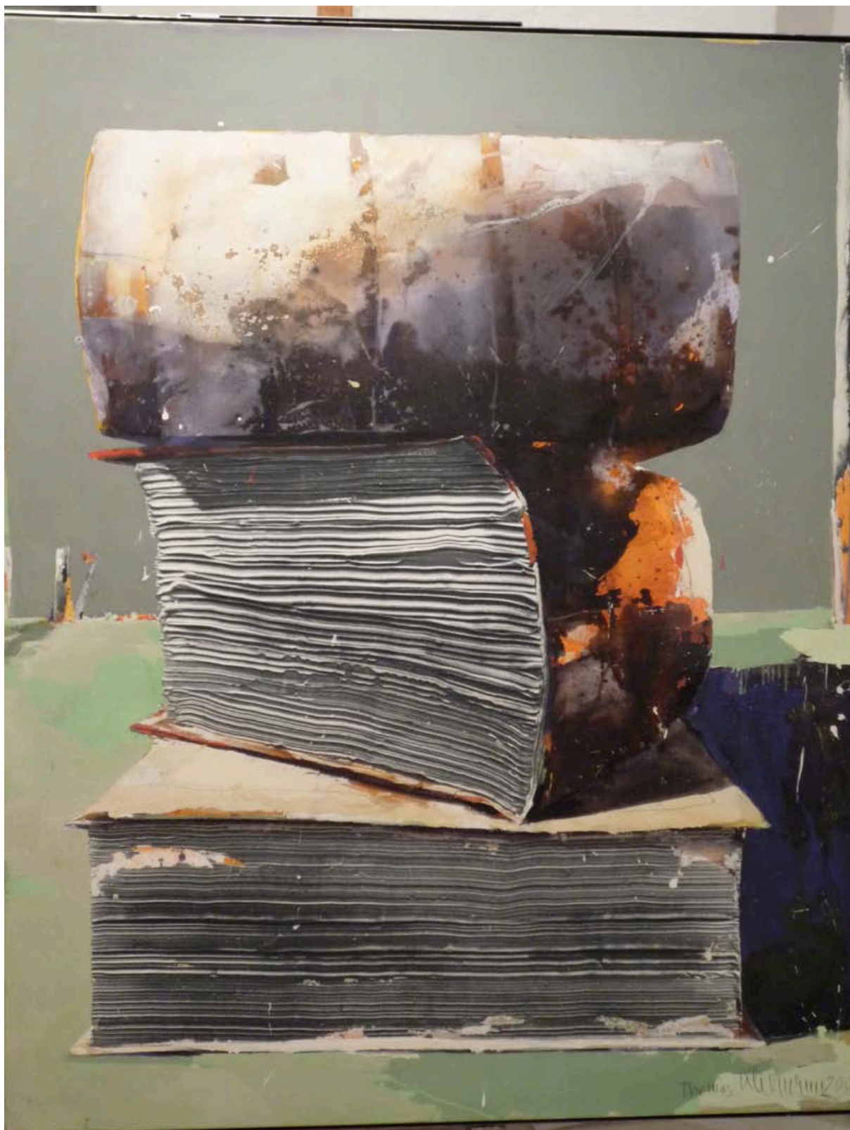
Round-green-table III, 2004, oil, acrylic, silicium carbide on canvas, 200 x 162 cm