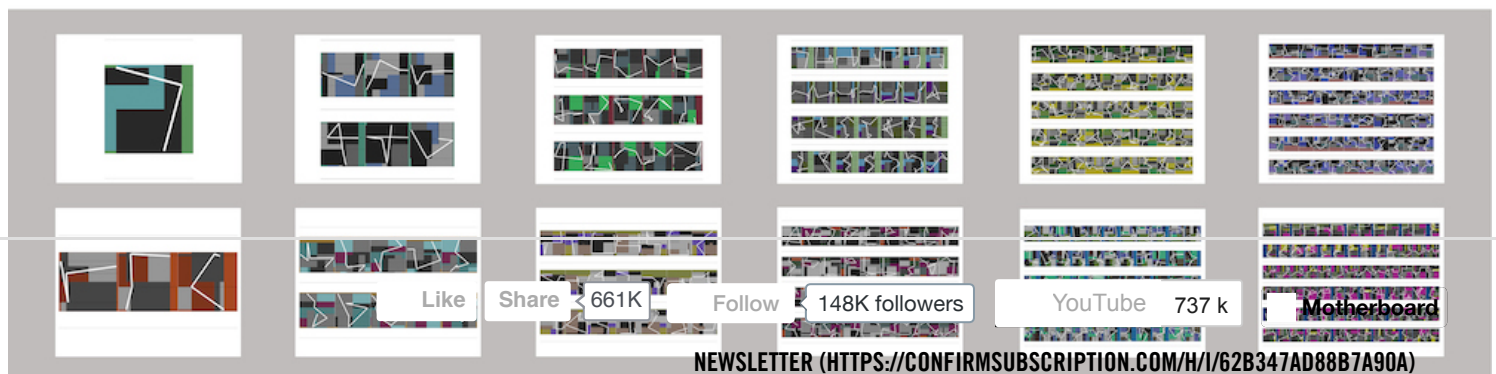
P1650_C (2015).

One of the earliest pioneers of digital art, for nearly 40 years now Mohr has been making algorithmic artworks inspired by and derived from the figure of the hypercube. In his very latest works, he traces its complex paths through up to a hundred dimensions of space. It has become, he told me, an “alphabet” from which he can spell out a limitless number of “abstract visual words.” Everything in his work extends from it and he sees no end to the possibilities.