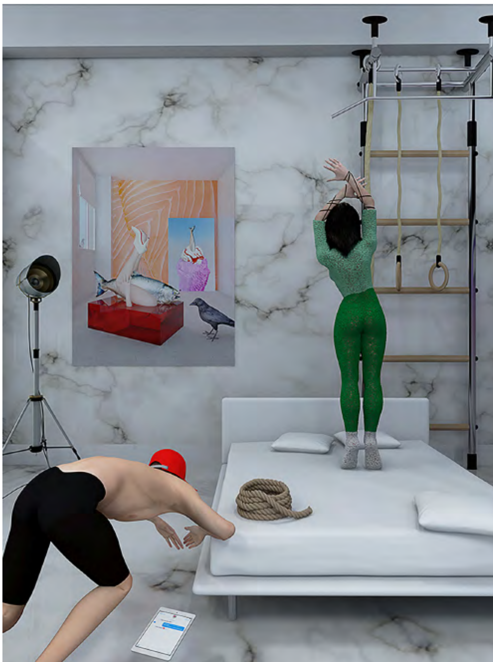
The myth of female solidarity Impression lenticulaire / Lenticular print 121 x 91 cm Unique